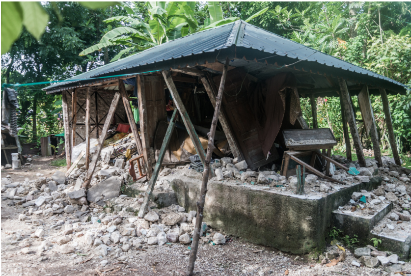
Farmers Houses destroyed ↓

Each organization was asked to assess the number of families who are members or close to the organization, victims of the earthquake and the storm, and to submit detailed lists. The organizations had to also verify the most urgent needs of the families, and the resumption of the functioning of the banks where they have their accounts. For security reasons, the names of the organizations are not included here but can be provided to donors and funders upon request and non-disclosure agreement signature.