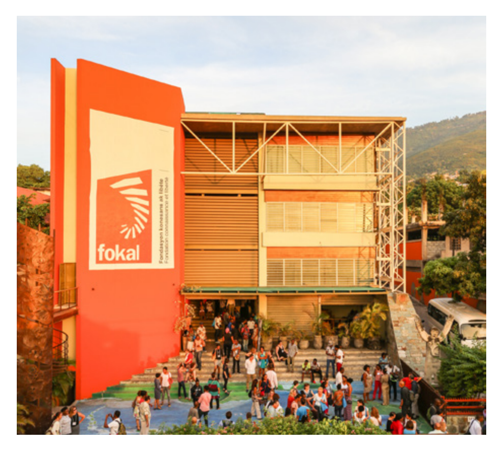
Fondation Connaissance et Liberté 2017